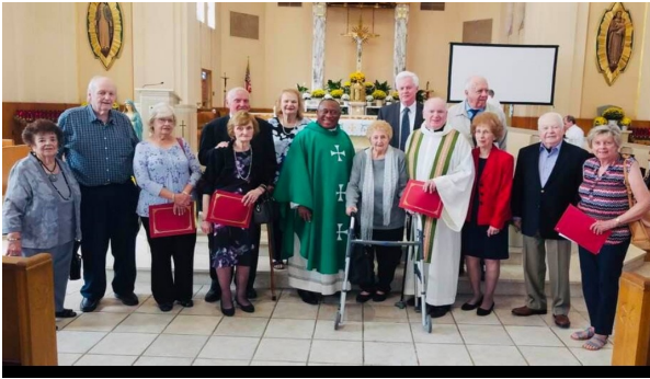
Long time parishioners (60 years and over) Honorees September 29th—St. Michael's Feast Day. 12:00 Noon Mass