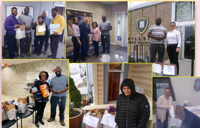
HUGS Ministry Distribution Members

Our next Grace Bags Distribution Day is Tuesday, March 24th , at the Parish Center located at 1211 Orange Avenue from 12:00 to 2:00 pm .